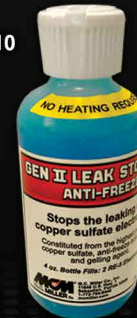
Cat. No. 18010