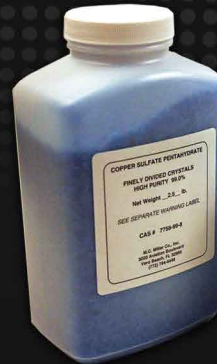
Cat. No. 17003

Finely divided high-purity crystals. Available in ¼ lb and 2 ½ lbs containers. Under normal conditions a ¼ lb container will be sufficient to maintain one electrode for a year.