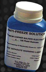
Cat. No. 17105