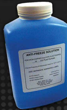
Cat. No. 17207

For use with any MCM electrode. Permits potential measurements with temperature as low as -10°F (-23°C) without danger of cracking electrode tube. Available in 8 oz. and 32 oz. (fl.) containers. Can be used year around.