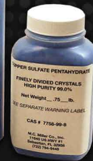
Cat. No. 16906