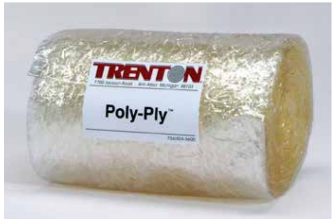
Because Trenton's Poly-Ply™ Outerwrap adheres to itself and is very conformable, it is very easy to apply.

Poly-Ply™ Outerwrap is only one of the outerwraps that Trenton offers to protect it's Wax-Tape® brand of anticorrosion wraps.