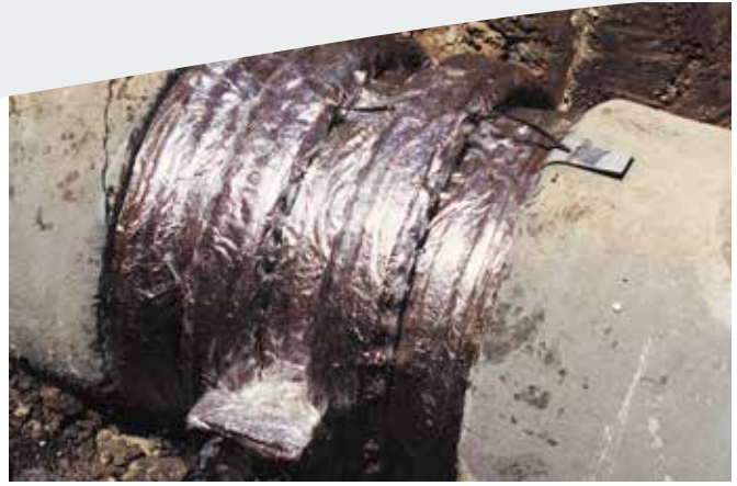
Poly-Ply™ Outerwrap is a multi-layer version of plastic wrap. It helps maintain a separation between Trenton Wax-Tape® anticorrosion wrap and the soil.